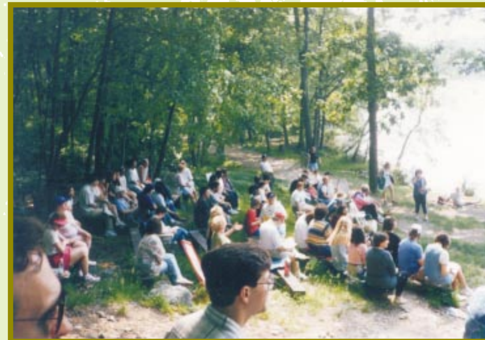
Gathering for our lakeside service

This special weekend retreat is being held at the Fairview Lake YMCA's premiere conference center nestled at the base of the Kittatinny Mountains in Northwestern New Jersey. The YMCA's 600 acre site, with beautiful, pristine, mile-long Fairview Lake as its center attraction, is a virtually unspoiled natural wonderland! Our joyous praise and teaching services are held by the lakeside in the mornings, and beneath the stars around a campfire in the evenings. There's our Saturday early morning hike and worship service atop the fantastic Kittatinny Ridge (optional, of course), a beautiful Saturday afternoon lakeside baptism service, a moving outdoor Sunday morning Communion service, and so much more (see our schedule of events).