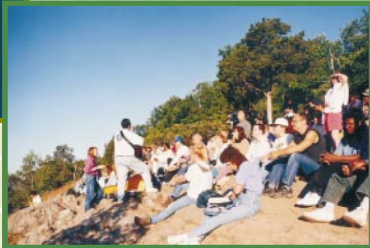
Early morning devotions on Kittatinny Ridge

“What a wonderful, glorious, Spirit-filled retreat which ended all too soon, for me and my grandson. Everything that went on was so anointed by God’s Holy Spirit and the presence of the majesty of Jesus Christ, one could not help being blessed.” Ulysses, NY