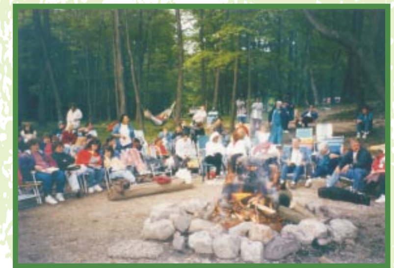
Gathering around the campfire for our evening worship service.