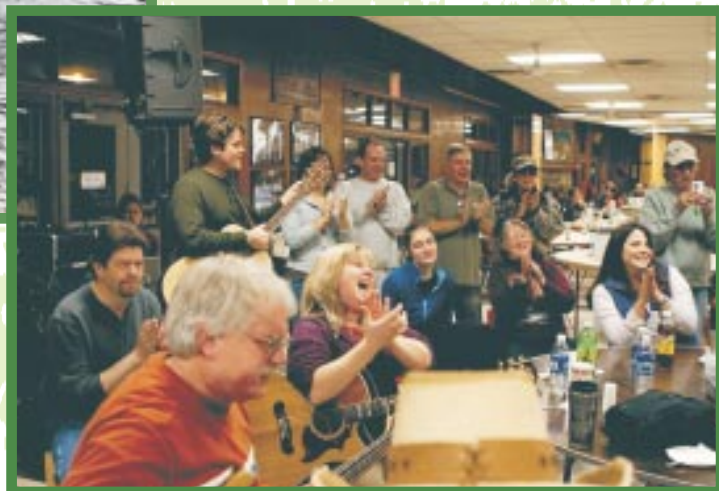
Sweet fellowship in the dining hall.