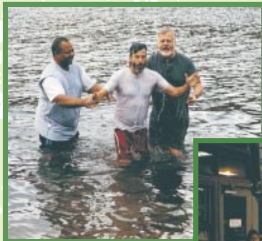
Our wonderful baptism service