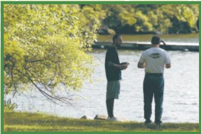
Fellowship by the lake