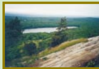
Fairview Lake view from the Ridge

7:00 AM Lakeside Worship & Devotions with Rev. Peter Foti 8:30 AM Breakfast 9:30 AM Lakeside Worship, Teaching & Communion Service 12:30 PM Lunch Afternoon Free until checkout (3pm)